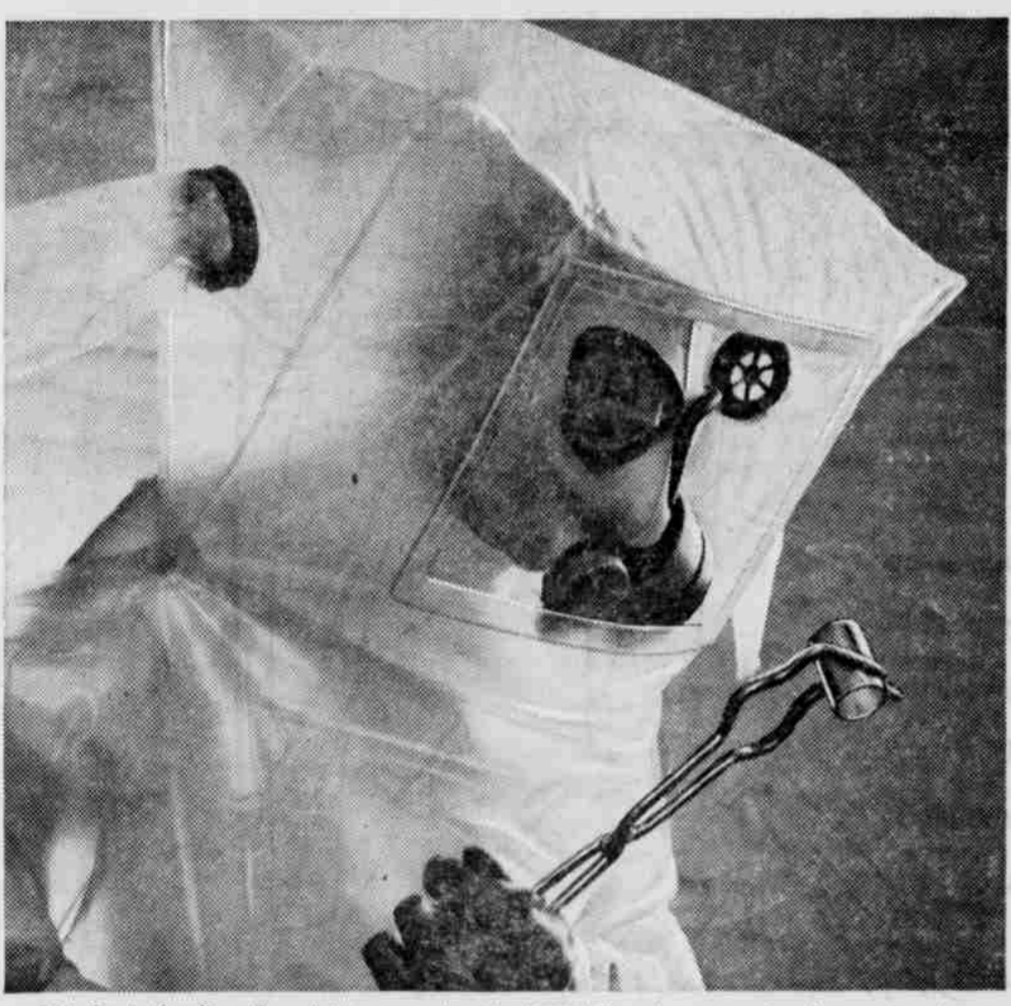
Protective plastic suit enables technicians to work safely. 12,000 G.E. employees are assigned to atomic projects.

Full-sized plants will generate electricity from atomic energy without government subsidy