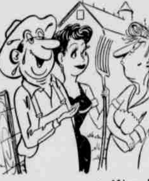
"Darling, meet Miss La Vere. Our new farm hand - I thought!"