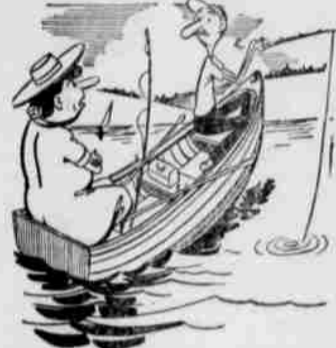
"I want a Guaranteed Annual Catch—and no monkey business!"