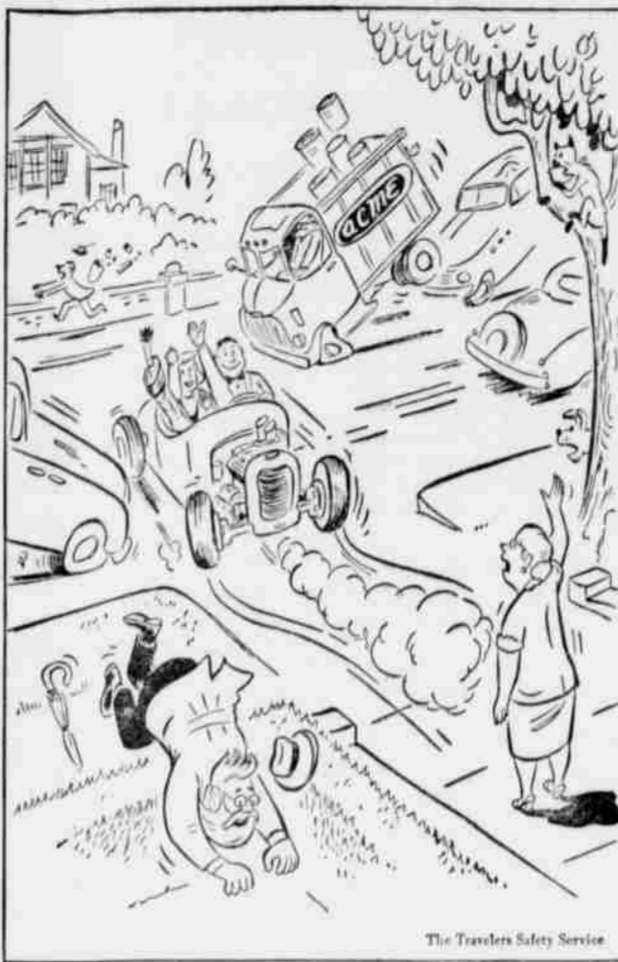
Lucky you—you impressed your friends without killing them