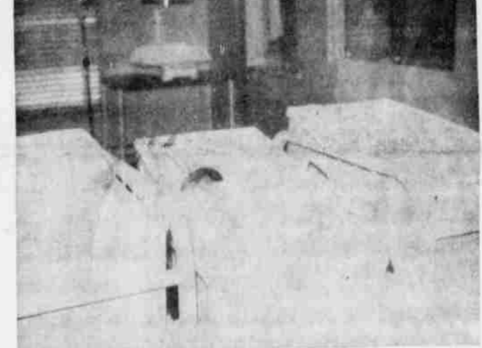
MOST POPULAR spot in hospital among regular visitors, especially the proud papas, is the glass enclosed nursery which at the time the picture was taken accommodated only four babies. Photographer was not allowed inside the room and had to take shot through the glass partition. The entire hospital was open to the public with staff members on hand to show visitors through.