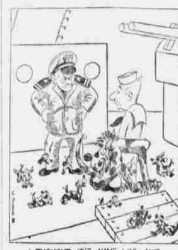
I THOUGHT IT'S NAME WAS JANE