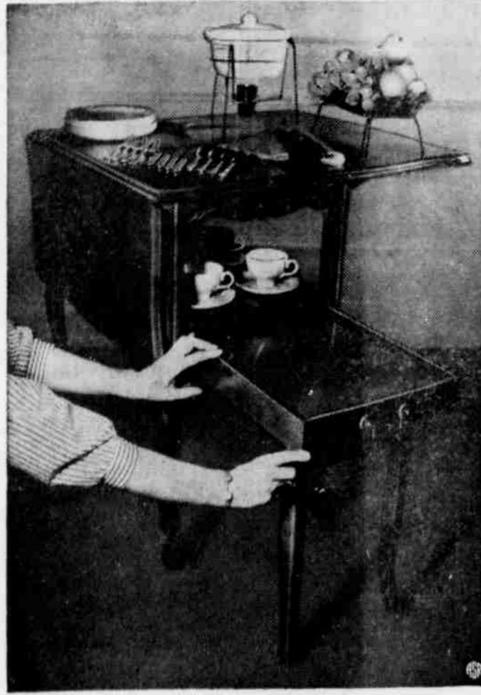
To serve your favorite casseroles or snacks for informal parties, there is nothing to take the place of the mobile serving cart. Shown is a lovely French Provincial cart that is both decorative and extremely utilitarian. Note the drop leaves, the storage shelf, and the pull-out table. This removable table gives additional serving area. It's a party-on-wheels item of furniture. Finish is French walnut.