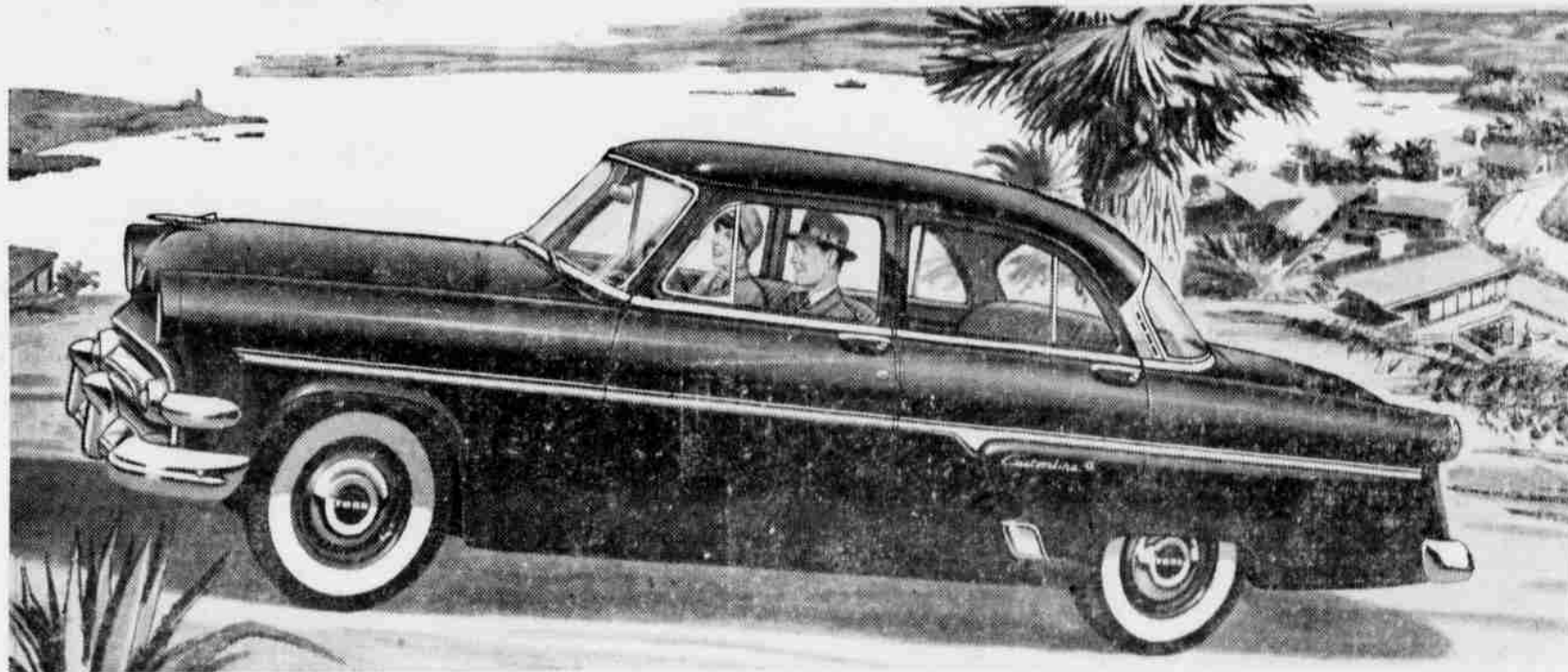
The new I-block Six-Fordomatic Drive combination is available in any of Ford's 14 body styles. Illustrated is the Customline Six Fordor Sedan.