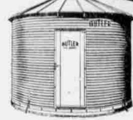
Butler 1000 Bushel Grain Bin