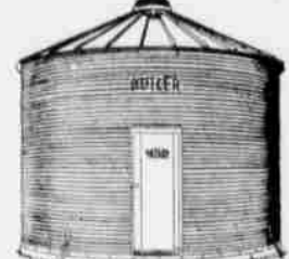
Butler 2200 Bushel Grain Bin