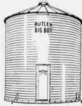
Butler 3276 Bushel Grain Bin