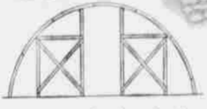
Set the other half arch on the other side of the scaffold. Lap and bolt to complete one full arch. Continue this same procedure, building rows together until your building is completely erected.