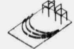
You simply make an erection scaffold slightly shorter than the height of the size building ordered. Lap and bolt half arches on the ground as indicated.

ERECT YOUR OWN "TRUSSLESS" 18 gauge steel STORAGE Building in a FEW DAYS ... IT'S THIS EASY