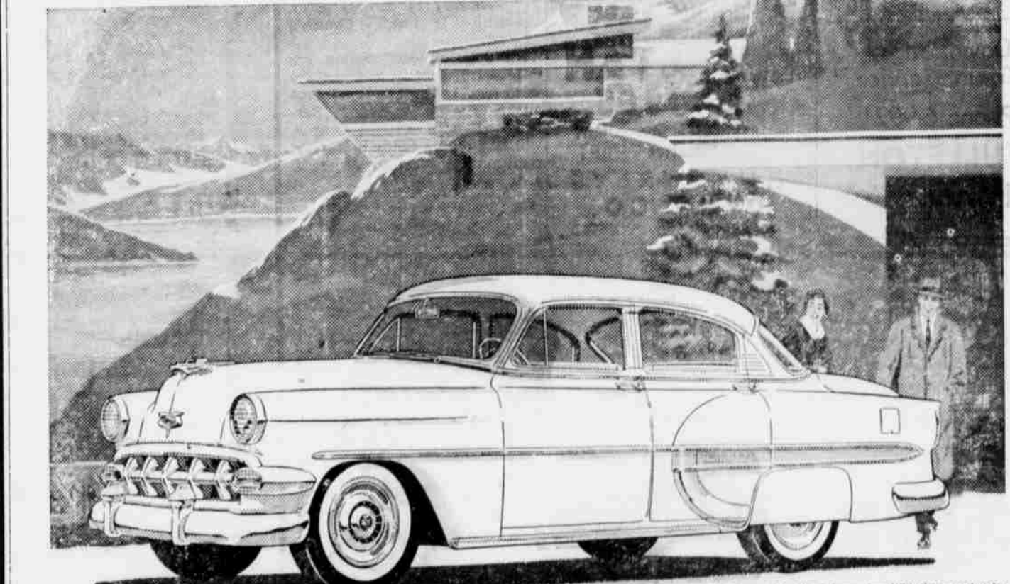
The new 1954 Chevrolet Bel Air 4-door sedan. With three great series Chevrolet offers the most beautiful choice of models in its field.

For sheer flattery—these glamorous 60-gauge, 15-denier no-gloss nylons, perfectly proportioned to fit any leg size! Extra high twist gives more elasticity. Choose from attractive dark or plain seams in four fashion-right shades... NOW!