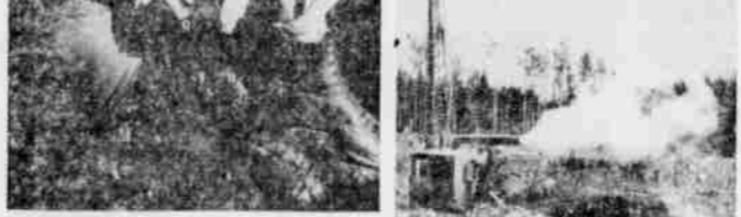
NEW CITIES being hacked out of wilderness reflect size of taconite program. Trucks like this International work 24 hours a day; carpenters hammer at new houses. There's new life on Mesabi!