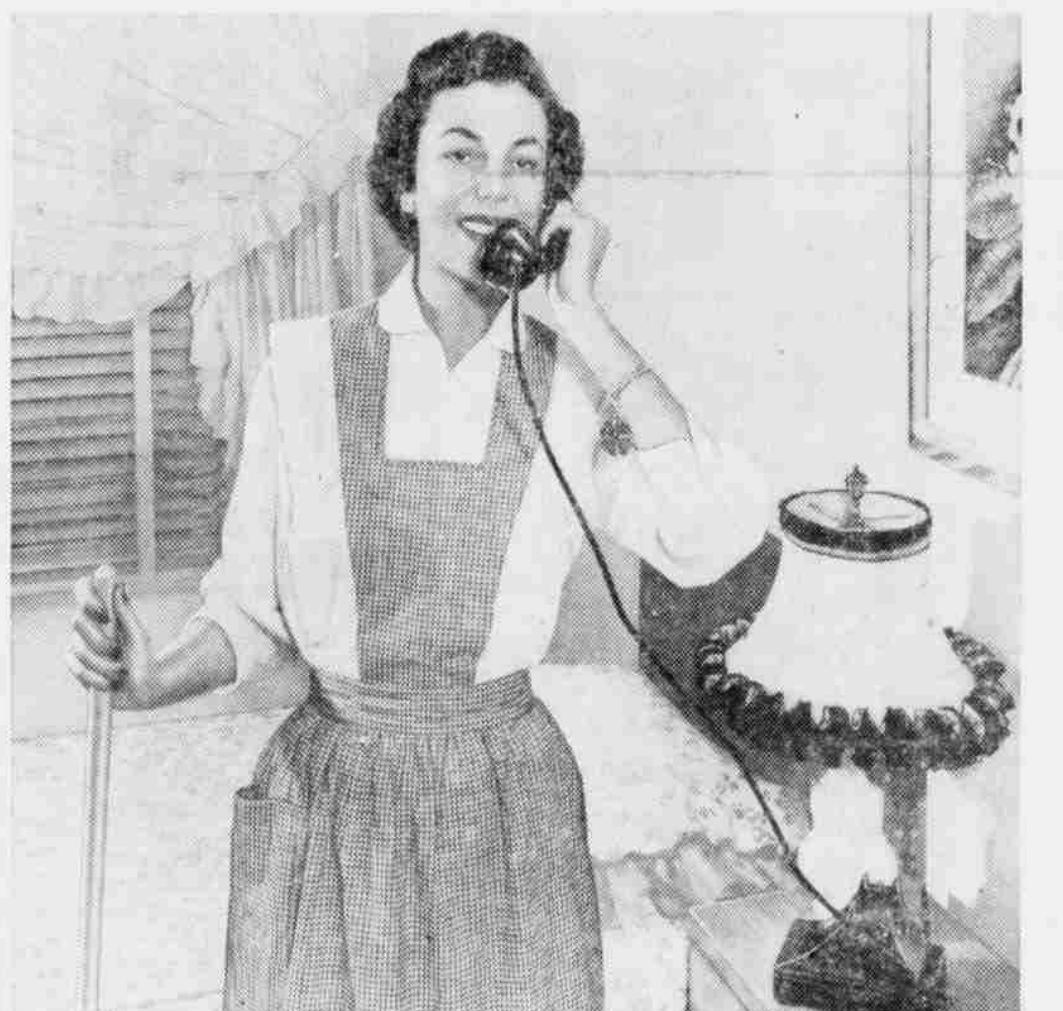
With an extension telephone, you save many steps during the day—and have a telephone handy to answer calls at night.