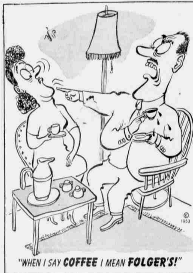
"WHEN I SAY COFFEE I MEAN FOLGER'S!"