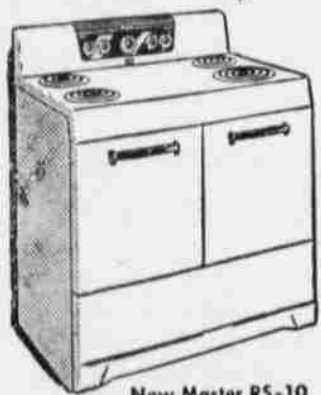
Now Master R5-10

for this genuine 40 inch FRIGIDAIRE Electric Range!