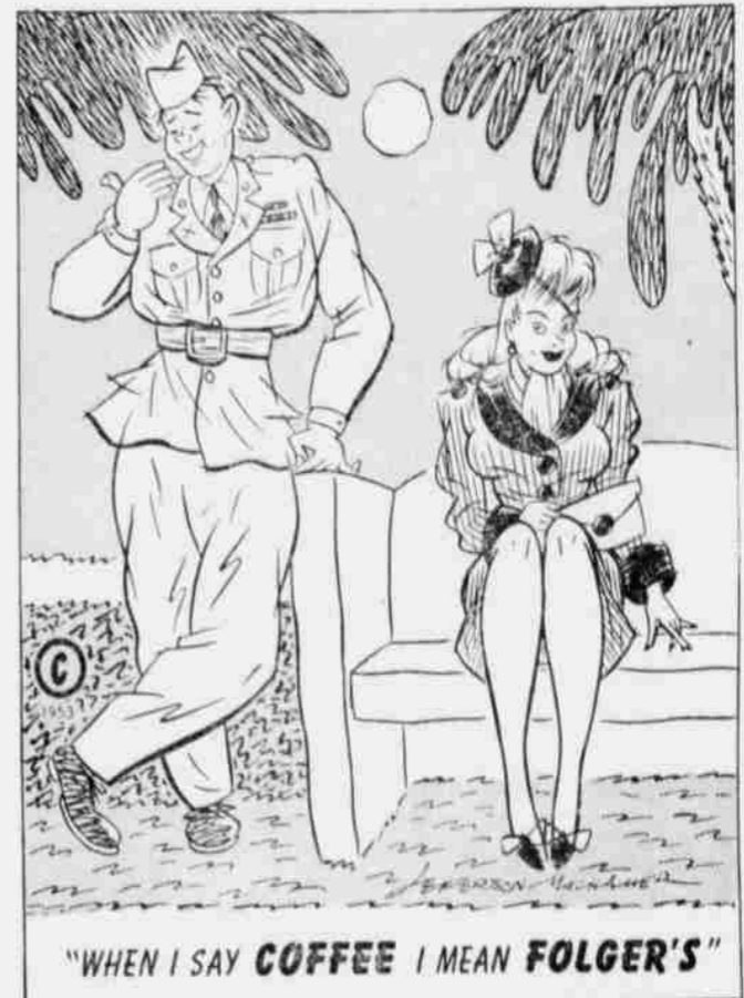
"WHEN I SAY COFFEE I MEAN FOLGER'S"