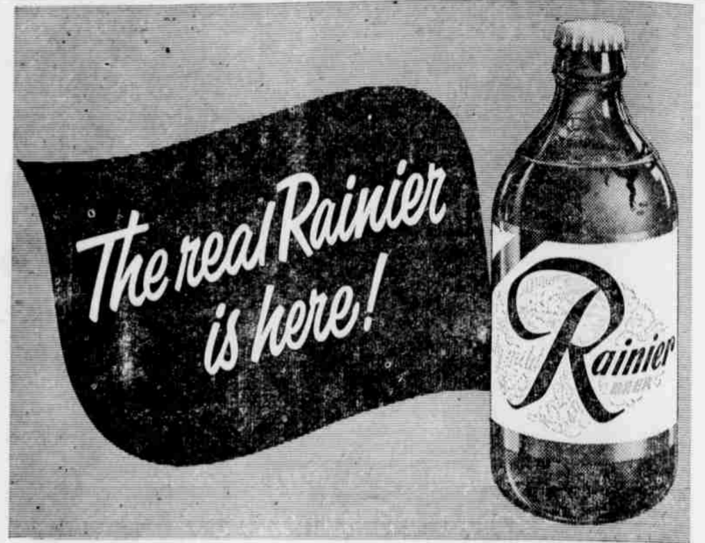
Sick's Spokane Brewery, Inc.

C AND C DISTRIBUTING COMPANY 514 South Main Phone 1512 Pendleton, Ore