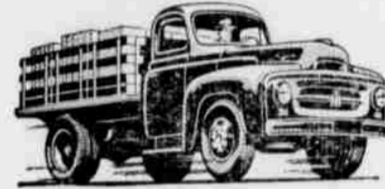
Three light-duty stake models. 7 1/2 and 8 1/2-foot bodies. GVW ratings 4,200 to 8,600 lbs.