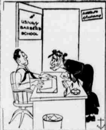
"I'd like to see the commanding officer!"