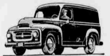
Six panel models. Inside body length 90 inches. All-steel body. GVW ratings 4,200 to 6,500 lbs.

LEXINGTON IMPLEMENT CO. LEXINGTON, OREGON