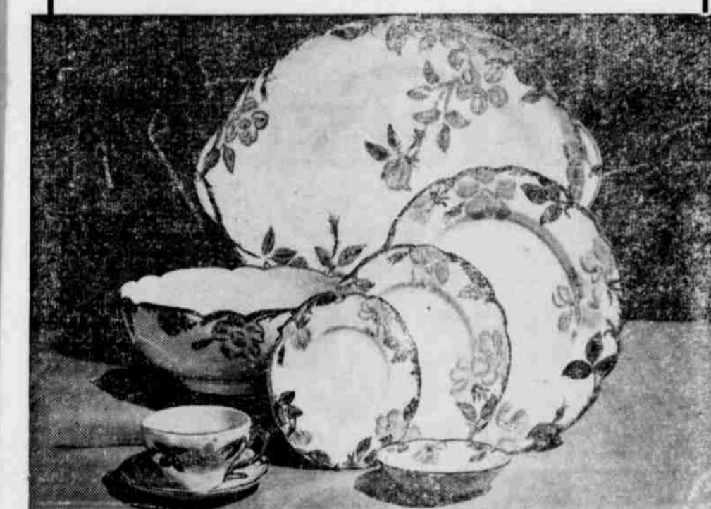
DESERT ROSE PATTERN — LARGE PLATTER, $3.40; SALAD BOWL, $3.80; FRUIT, $.72; CUP & SAUCER, $1.56; SAL. PLATE, $1.04; DINNER PLATE, $1.56; CHOP PLATE, $3.16.

FRANCISCAN WARE 20TH ANNIVERSARY SALE Sept. 21 Thru Oct. 10