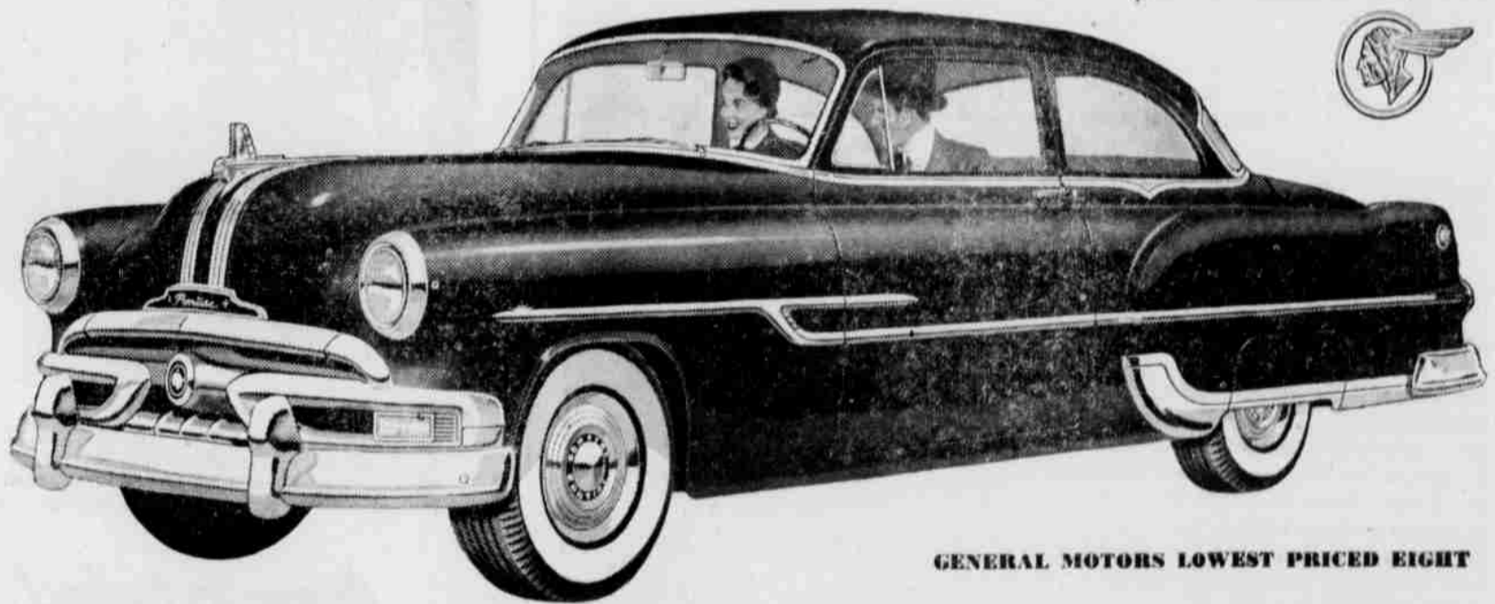
GENERAL MOTORS LOWEST PRICED EIGHT

DRIVE IT! PRICE IT! Then Compare The Deal!