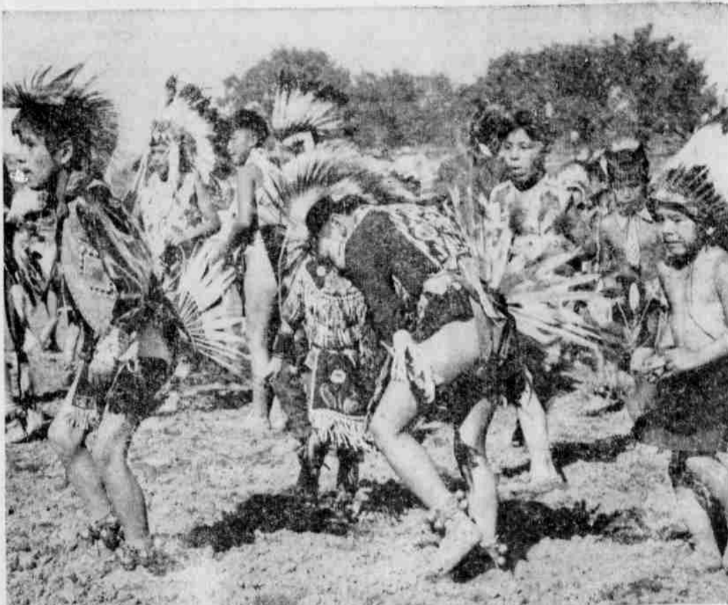
The largest gathering of Indians to be seen at any Western show come to the world-famous Pendleton Round-Up. They live in tents on the Round-Up grounds and participate in the arena shows and the Westward Ho! parade, and the Friday morning, Sept. 11, Round-Up audiences particularly like the dancing of Indian children. Round-Up dates are Sept. 10-11-12.