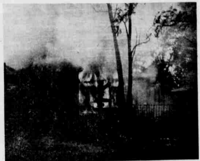
SUNDAY MORNING FIRE which caused nearly $2,500 damage was caught at its height by photographer. Dense clouds of smoke obscured the larger building to the rear which also was a mass of flames when firemen arrived, but attracted a large crowd of persons to the scene on West Baltimore street.