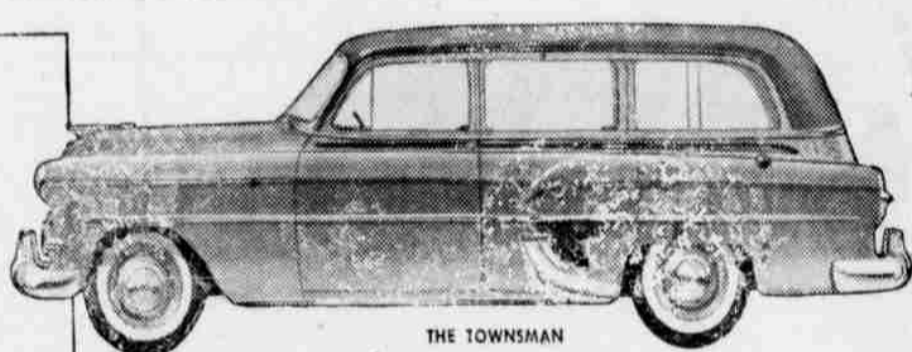
THE TOWNSMAN Beautiful, simulated wood-grain trim. Plenty of room for 8 passengers. Center and rear seats can be removed for extra carrying space.