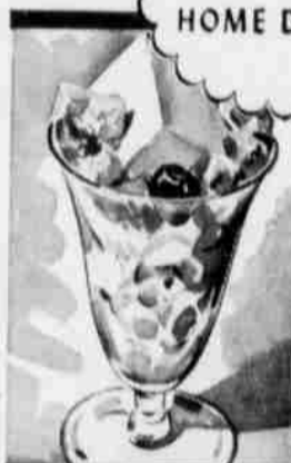
TRY IT WITH FRESH FRUITS