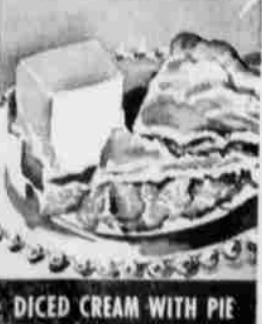
DICED CREAM WITH PIE