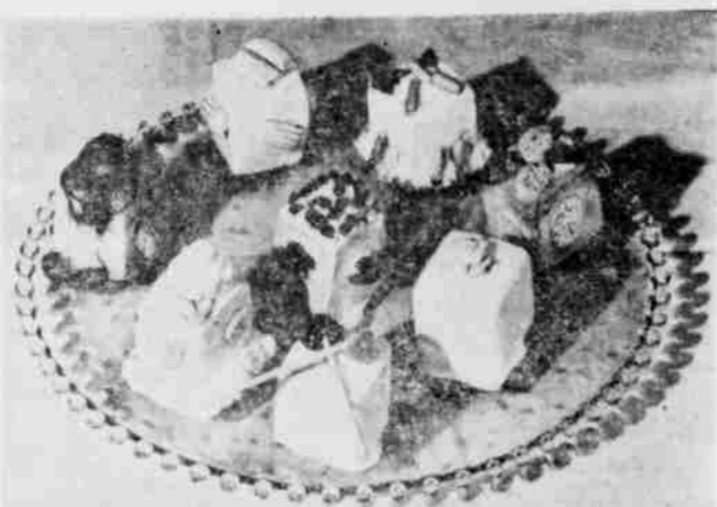
NEW ICE CREAM idea introduced this week to northwest customers is "Diced Cream", individually packaged servings. It comes in a variety of flavors.