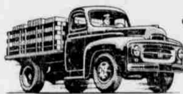
New Model R-130 Stake. Three light-duty stake models, 7 1/2 and 8 1/2-foot bodies. GVW ratings, 4,200 to 8,600 lbs. Famous Comfo-Vision cab.