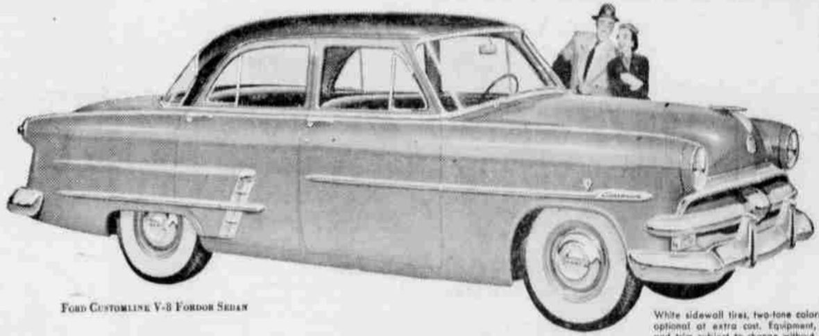
FORD CUSTOMLINE V-8 FORDOR SEDAN

White sidewall tires, two-tone colors illustrated optional at extra cost. Equipment, accessories and trim subject to change without notice.