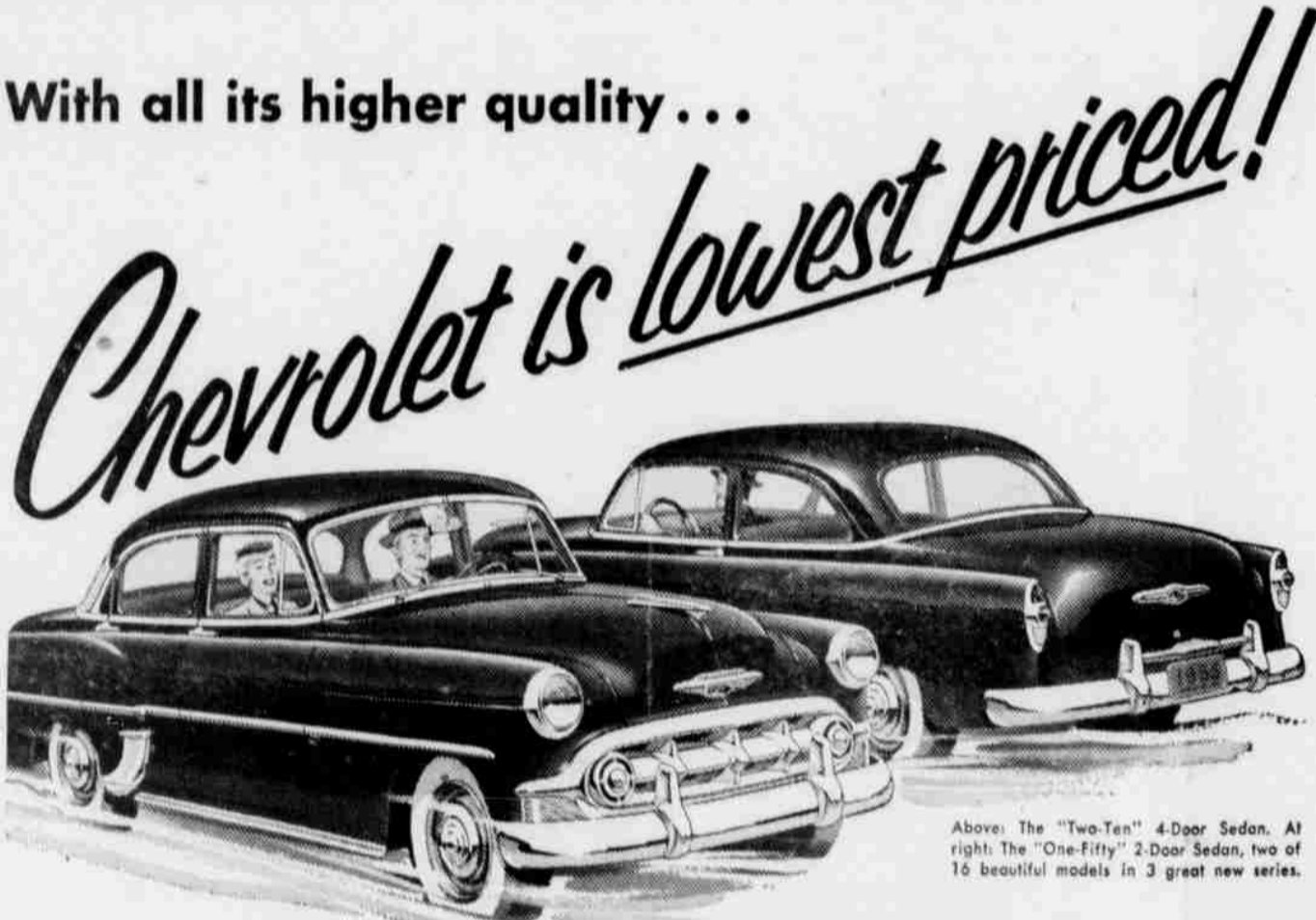
Above: The "Two-Ten" 4-Door Sedan. At right: The "One-Fifty" 2-Door Sedan, two of 16 beautiful models in 3 great new series.

It brings you more new features, more fine-car advantages, more real quality for your money . . . and it's America's lowest-priced full-size car!