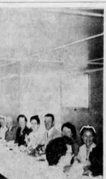
HOMEMAKERS EAT—shown are but a few of the nearly 150 persons who attended the county Homemaker's Festival held Tuesday at Willows grange hall in Ione. All sections of the county were represented at the day-long meeting.

A drivers license examiner from the secretary of state's office will be in Heppner at the court house Tuesday, May 12 from 9:30 to 3:30.