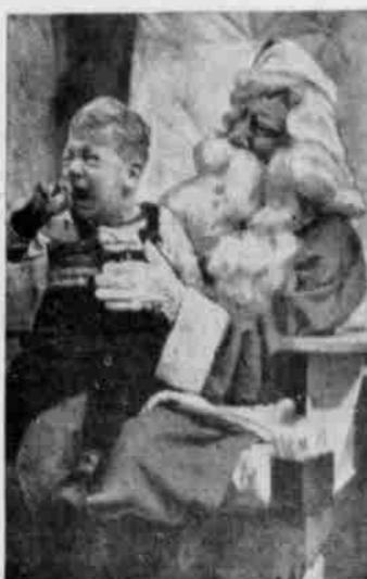
ALLERGIC TO WHISKERS . . . Not all little boys who love Santa Claus this time of year have a sublime trust in the old gent. This young man obviously wishes he were somewhere else.

It was the custom in Kent, England, for young men to go from house to house with the hodening horse, an imitation of a horse's head attached to a long stick. Two lads, forming the body of the horse, were hidden from view by a covering of cloth resembling horse's skin. The hodening horse was accompanied by paraders who rang the bells throughout the town and begged for money or food.