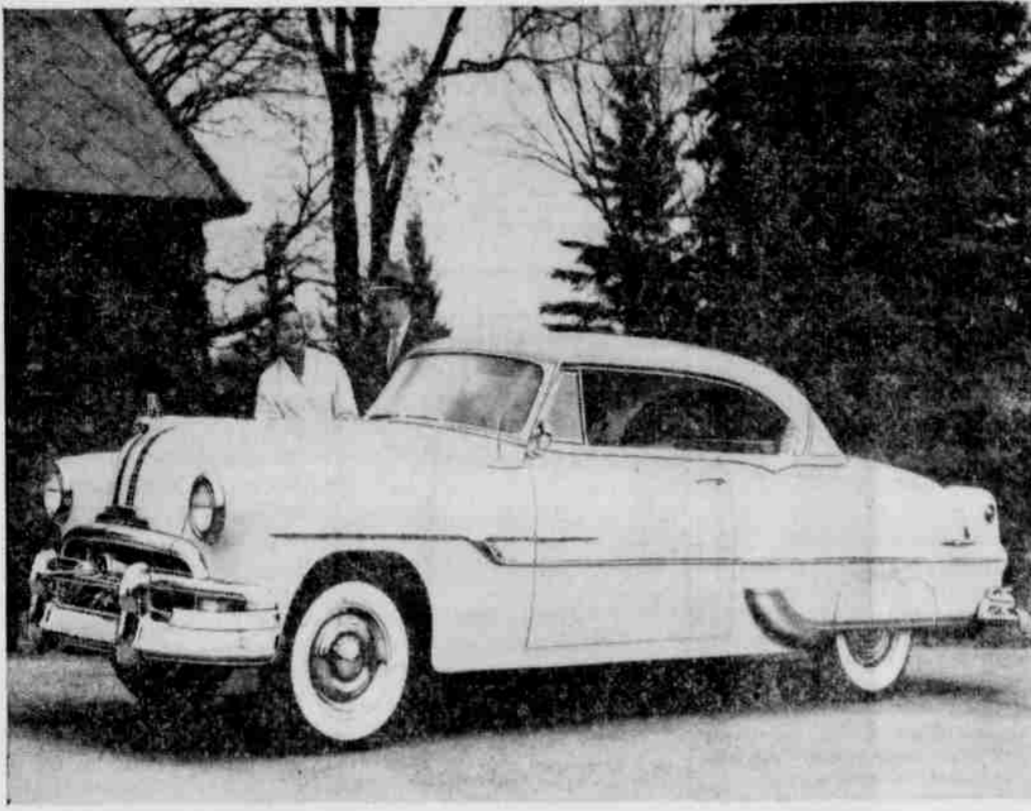
In nationwide dealer showings, Pontiac Division of General Motors today introduced its new line of Dual-Streak Chiefline models, featuring longer wheelbase, increased vision and new curve-control front suspension. Advanced styling is marked by smooth contours, rear fender fin and high deck lid, one-piece curved windshield, wrap-around one-piece rear windows, roomier interiors and entirely new radiator grille and chrome treatment. Above is the new Custom Catalina, one of 11 body types in three Chiefline series: Special, De Luxe and Custom. Wheelbase for all series is 122 inches, with Power Steering as optional equipment.