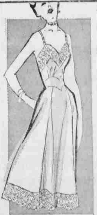
Four-gore style with bias-cut midriff, pastels or white, 32-52.