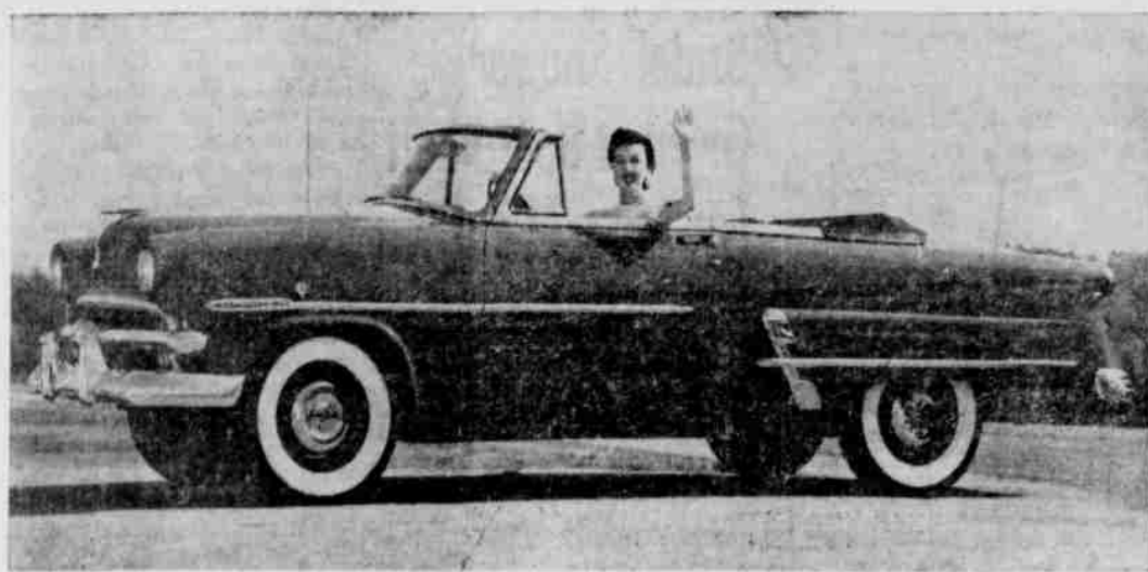
The 1953 Ford Crestline Sunliner with its smart open car styling is available in 12 new colors ranging from Coral Flame Red to Raven Black. With its "Breezeaway" top up, the Sunliner provides the weather-tight comfort of a sedan. Two-tone leather and vinyl seats blend with inside paneling and harmonize with outside colors.