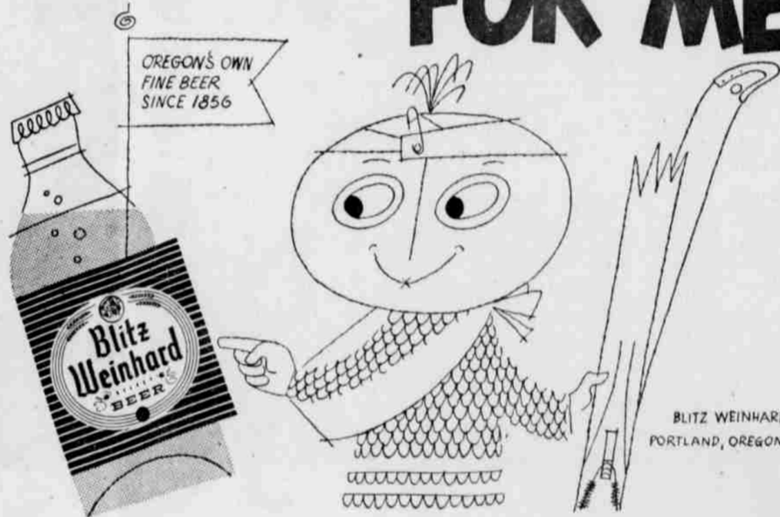
BLITZ WEINHARD COMPANY PORTLAND, OREGON