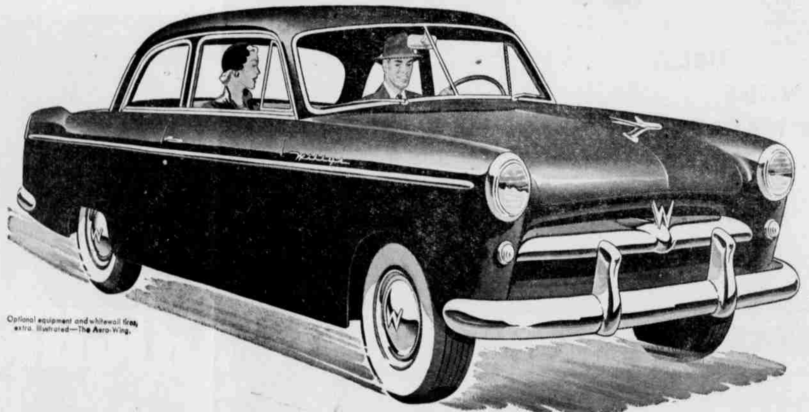
Optional equipment and whitewall tires, extra. Illustrated—The Aero-Wing.