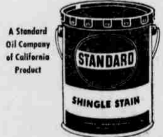
A Standard Oil Company of California Product

If you have a barn, shingled roof, fence or other unpainted wood surfaces to stain . . . do the job efficiently with Standard Shingle Stain. It comes ready to use. One gallon will give two coats on 90 to 125 square feet. Apply with brush or sprayer.