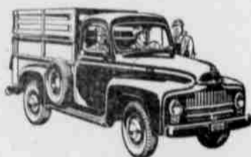
Right for the farm. The AD-A-RAK adds real utility to your International pickup. Available for 6 1/2, 8, or 9-ft. pickup bodies.