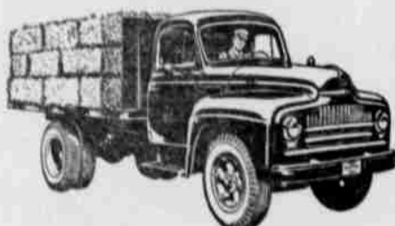
Use it hard! The International L-160 series is famous for its stamina. Stake body sides removable for flat-bed utility as shown.

Better roads mean a better America For complete information about any International Truck, see—