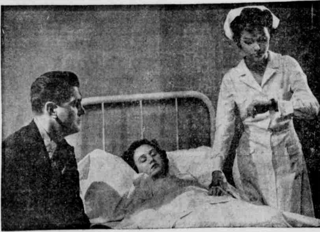
HOSPITAL BOARD AND ROOM