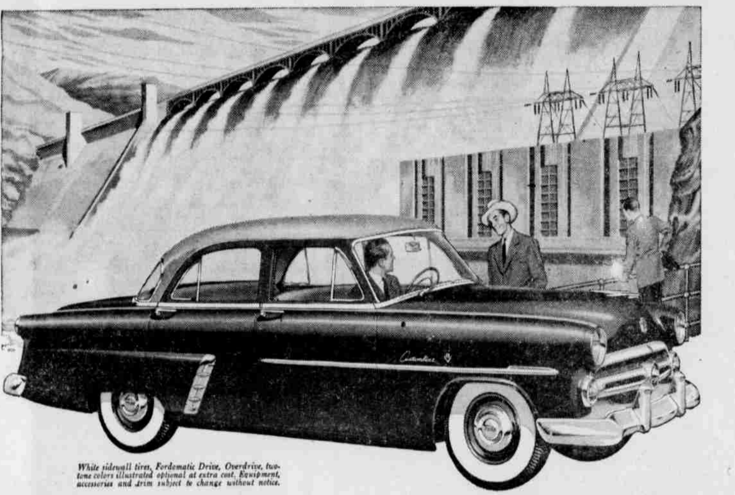
White sidewall tires, Fordomatic Drive, Overdrive, two-tone colors illustrated optional at extra cost. Equipment, accessories and trim subject to change without notice.