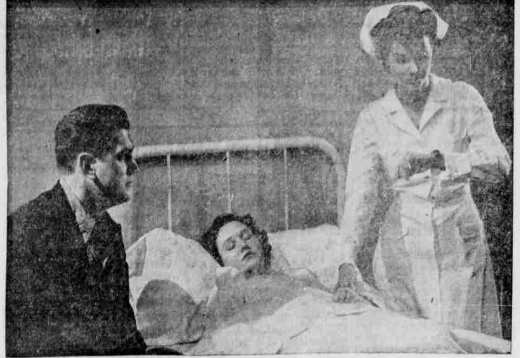
HOSPITAL BOARD AND ROOM