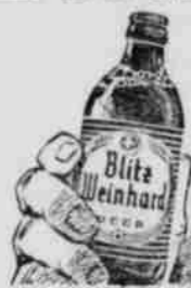
BLITZ WEINHARD COMPANY, PORTLAND, OREGON