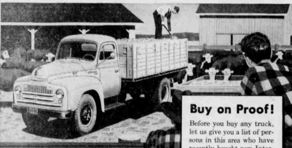
International L-160 models offer 130 to 172-in. wheelbases, GVW ratings from 14,000 to 16,500 lbs.

For complete information about any International Truck, see—