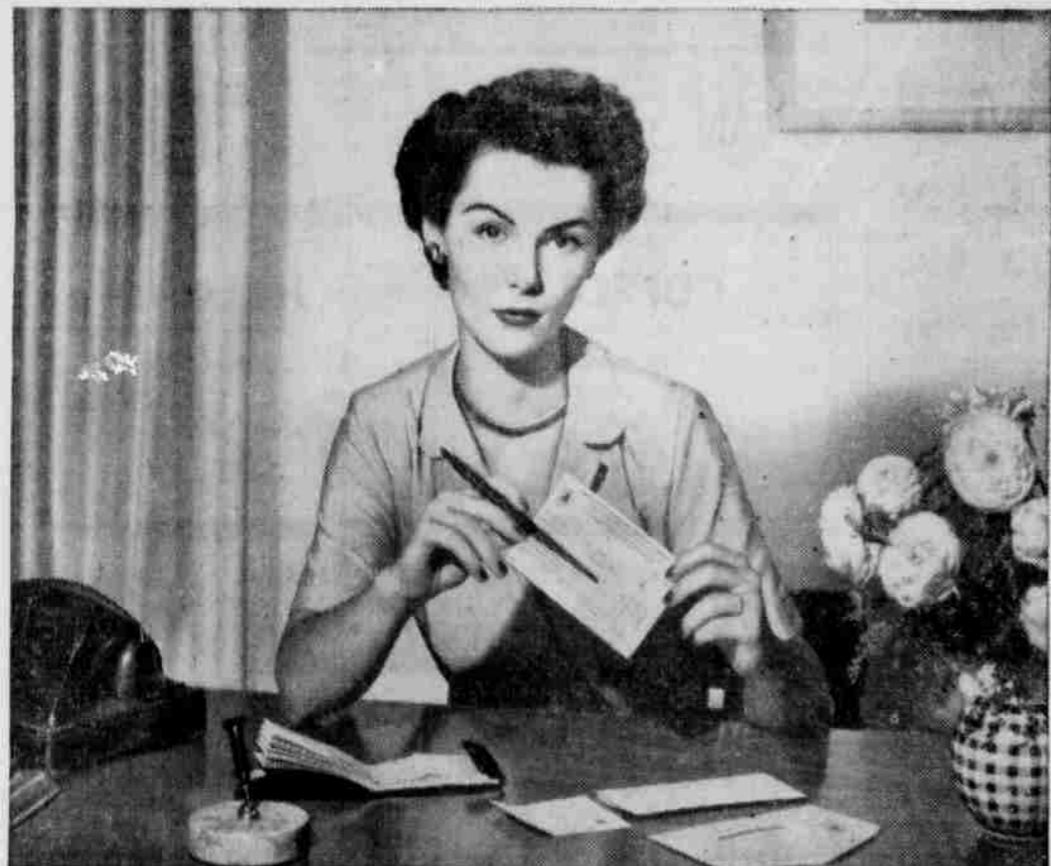
When you pay your telephone bill, about 28 cents of each dollar goes for taxes.