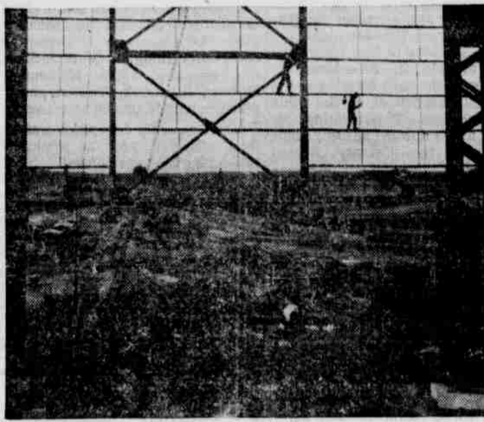
NEW STEEL FACILITIES TAKE SHAPE—Workman painting braces on the end of a new open hearth building. This new plant is part of the National Production Authority's program for the expansion of basic industry. It will play a major part in raising our steel capacity to 120 million ingot tons by the beginning of 1953.