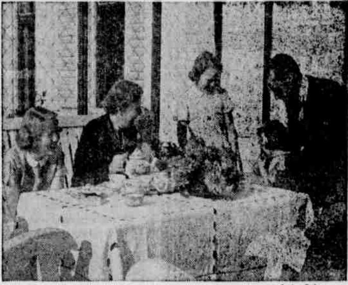
Queen Juliana of The Netherlands is on her first official visit to the United States since becoming Holland's monarch in 1948. With her husband Bernhard, Prince of The Netherlands, she will spend a few weeks in this country visiting Washington, New York and Midwestern and Western places of interest. The royal couple has brought one of the famous Dutch carillons as a gift from the Dutch people to the American people in token of friendship; it will be erected in a national park near Washington. Left behind in Holland to go to school are their four daughters, Princesses Beatrix, 14; Irene, 12; Margriet, 9; and Marijke, 5. Photo shows the family enjoying a final tea party together just before the parents' departure for America.