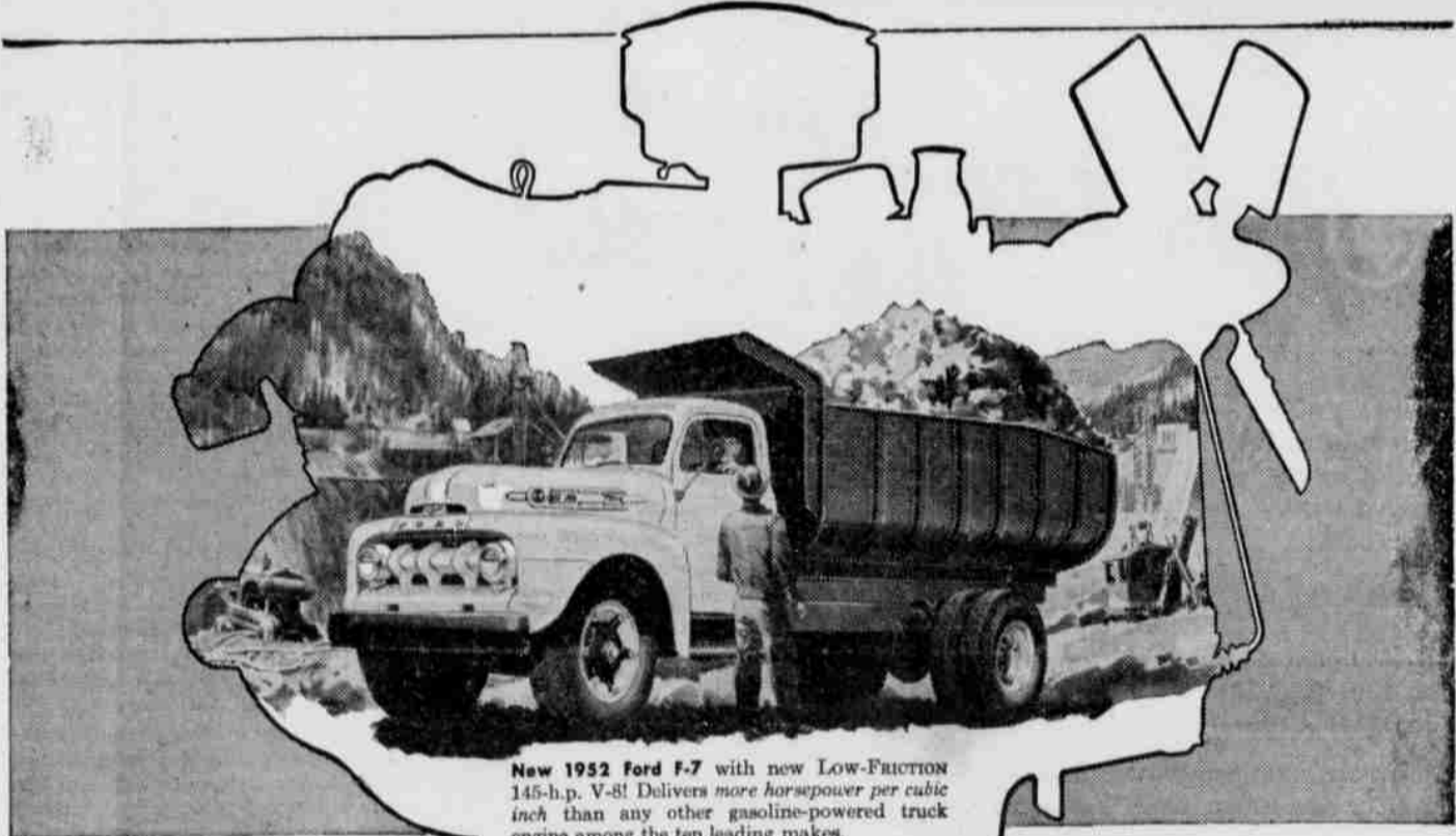
New 1952 Ford F-7 with new Low-Friction 145-h.p. V-8! Delivers more horsepower per cubic inch than any other gasoline-powered truck engine among the ten leading makes.