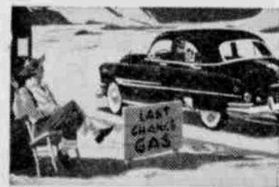
TOP ECONOMY— By reducing engine revolutions in relation to speed, Pontiac gives maximum economy.