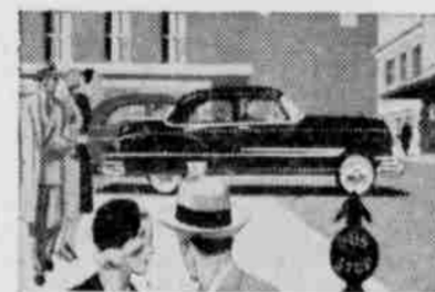
FLASHING ACCELERATION— Pontiac's amazing response to the accelerator gets you away in a flash.