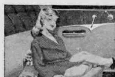
QUIET CRUISING— Pontiac cruises so quietly, smoothly and effortlessly you almost feel you're coasting.