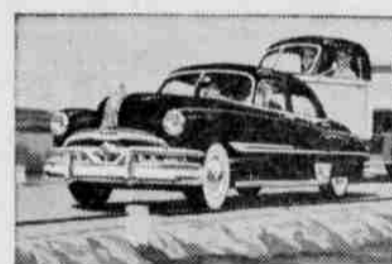
INSTANT SURGING POWER— You have plenty of surplus power, instantly ready for any emergency.