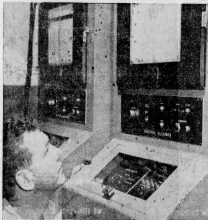
BETA RAY CONTROL PANEL—Here a Gates technician studies the control panel for the new beta ray gauge installed at The Gates Rubber Company plant in Denver, Colo. The control line on his chart gives a record of the uniformity of the rubber-filled cords then being measured. Measuring is done by a radioactive beam which passes through the cords.