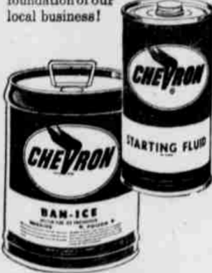
A Standard Oil Company of California Product

that you have plenty of Chevron Starting Fluid and Chevron Ban-Ice Fluid all season. We emphasize service because it is the foundation of our local business!