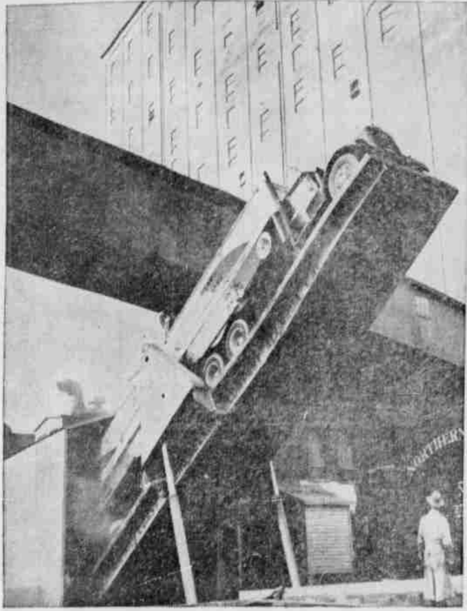
BIG LIFT —Recently installed at a Portland grain elevator is this truck hoist designed to rapidly unload bulk grain from trucks which has previously been impracticable due to length of time necessary to unload by hand.

By Ted Wagoner Staff Writer, The Oregonian