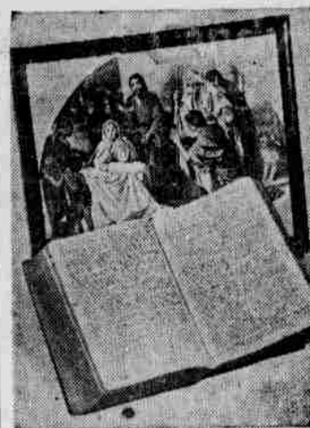
STABLE AT BETHLEHEM: The shepherds "came with haste and found Mary, and Joseph, and the Babe lying in a manger."

It is thought that St. Nicholas died about 345 A.D., and for 30 days following his festival day his genial spirit roamed the earth, filling the hearts of mankind with love and generosity. He gave the gifts without thought of return—the true spirit of St. Nicholas and Christmas.