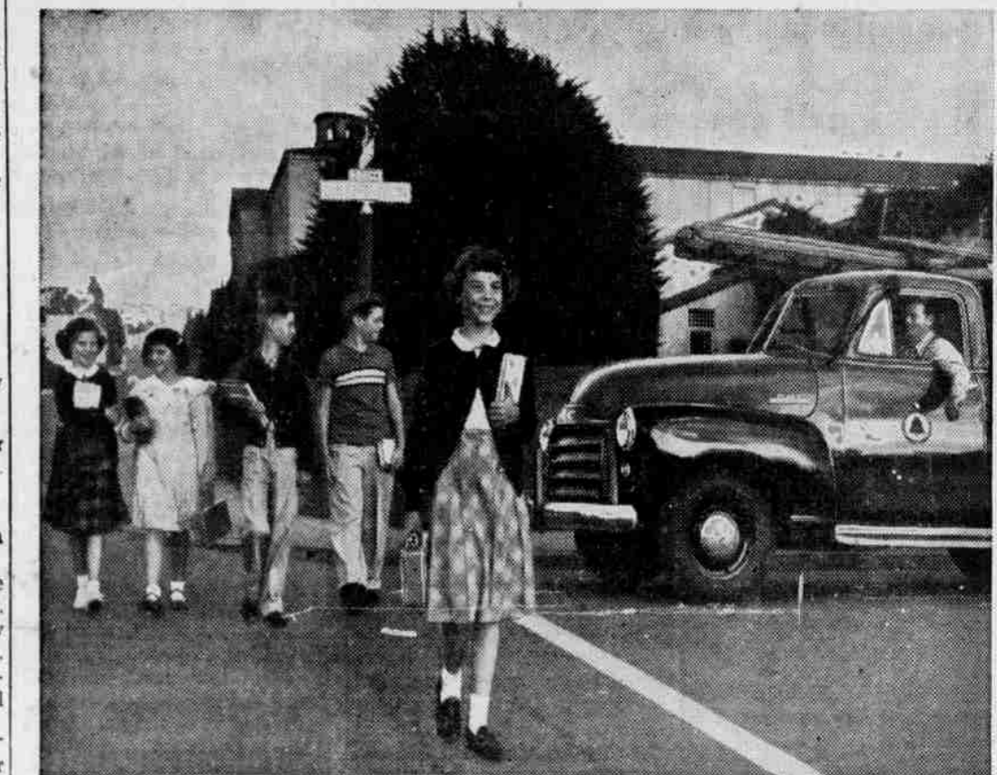
Careful training and observance of safety codes make telephone drivers among the safest on the road today.